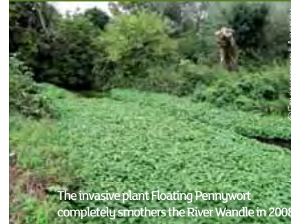
The invasive plant Floating Pennywort completely smothers the River Wandle in 2008

This guide, produced by the wild plant conservation charity Plantlife and the Royal Horticultural Society, can help you choose plants that are less likely to cause problems to the environment should they escape from your pond or aquarium. Even the most diligent fish- or pond-keeper cannot ensure that their plants do not escape into the wild (as some non-native invasive plants can re-grow from a tiny fragment of plant just 5mm long), so we hope you will find this helpful.