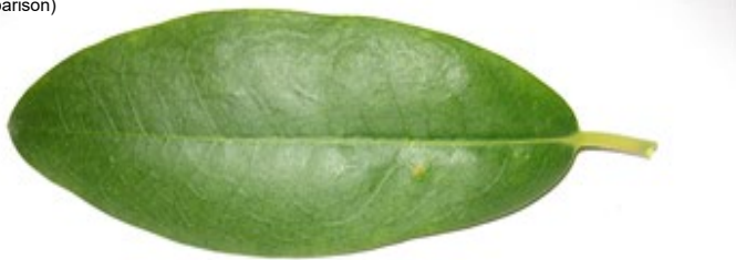
Cherry laurel leaf