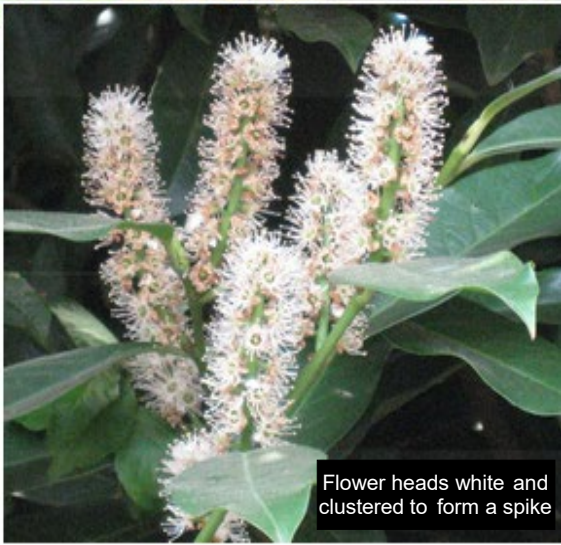
Flower heads white and clustered to form a spike