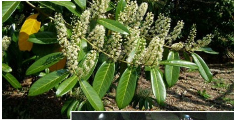
Leaves arranged alternately ending in a single leaf