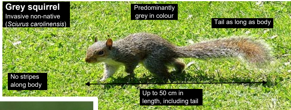
Grey squirrel Invasive non-native ( Sciurus carolinensis )