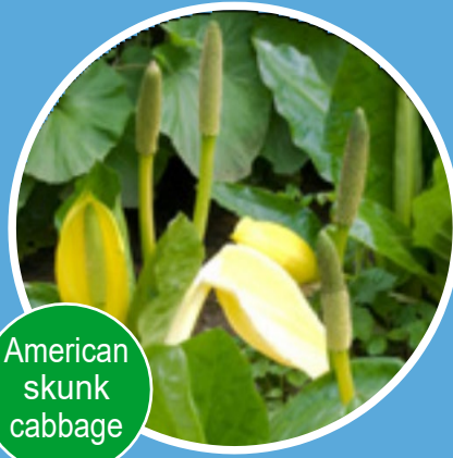
American skunk cabbage