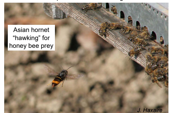
Asian hornet "hawking" for honey bee prey

Asian Hornet abdomen is almost entirely dark except for 4 th abdominal segment