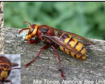
Mia Tonge, National Bee Unit