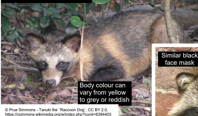
Raccoon dog Invasive non-native ( Nyctereutes procyonoides )

P. lotor (raccoon) may co-occur with Nyctereutes procyonoides (raccoon dog), a member of the Canidae family that also possesses a black mask and a body type similar to P. lotor , but have no ringed tail. The raccoon dog is also an invasive non-native species.