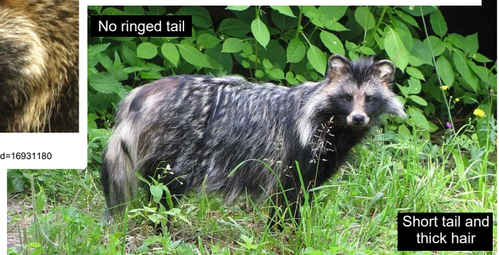
No ringed tail