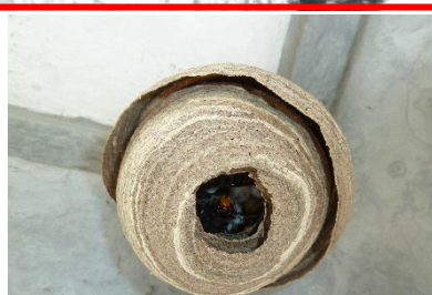
Primary nests inside buildings

Some common wasp nests and Asian hornet nests can look similar, only report nests if seen with Asian hornets.