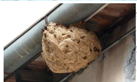
Secondary nest found in the eaves of a house