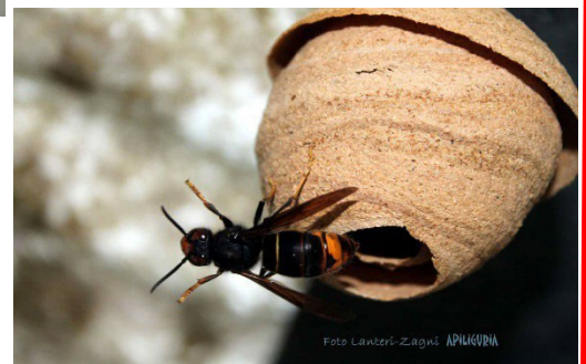
Primary nest on a building, with queen