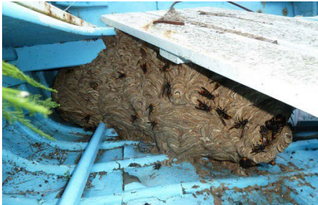
Secondary nest found in a boat