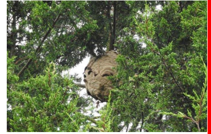
Secondary nests found in trees